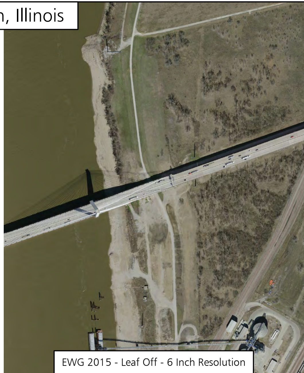
EWG 2015 - Leaf Off - 6 Inch Resolution