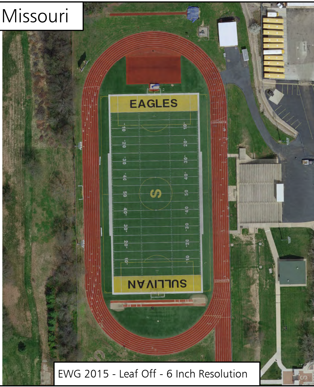
EWG 2015 - Leaf Off - 6 Inch Resolution