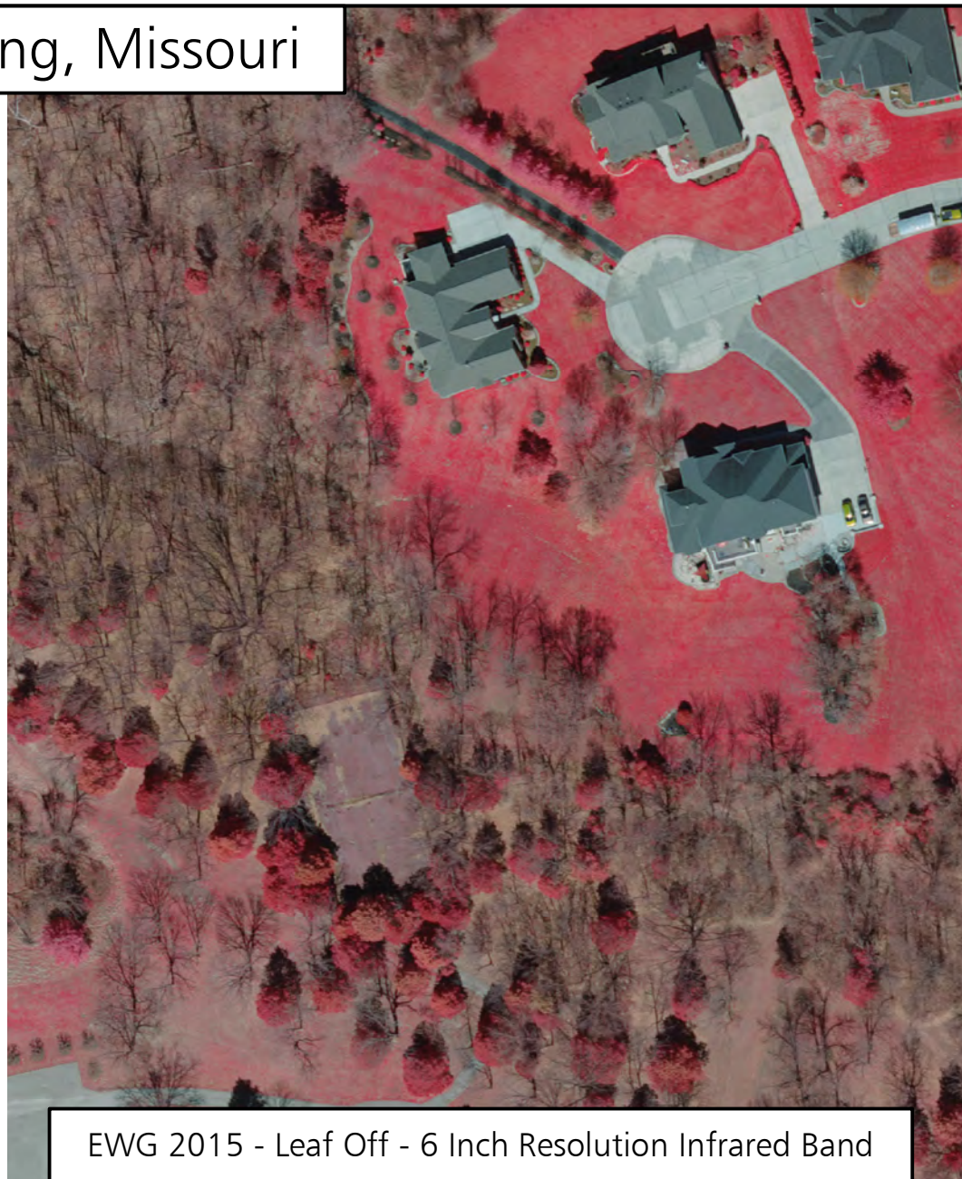
EWG 2015 - Leaf Off - 6 Inch Resolution Infrared Band